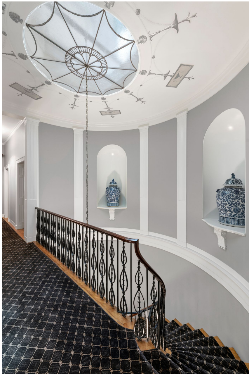
A skylight overlooks the elegant staircase at the heart of the home.